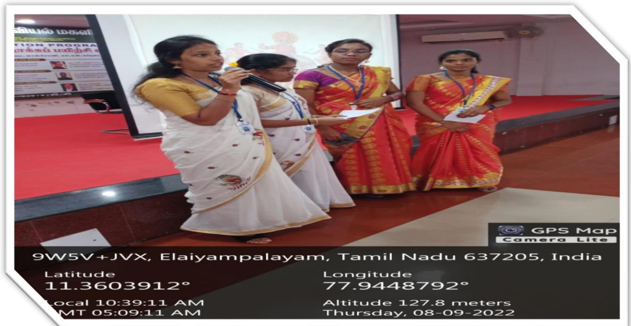
Students participated in the singing competitions at Multipurpose Hall, VICAS