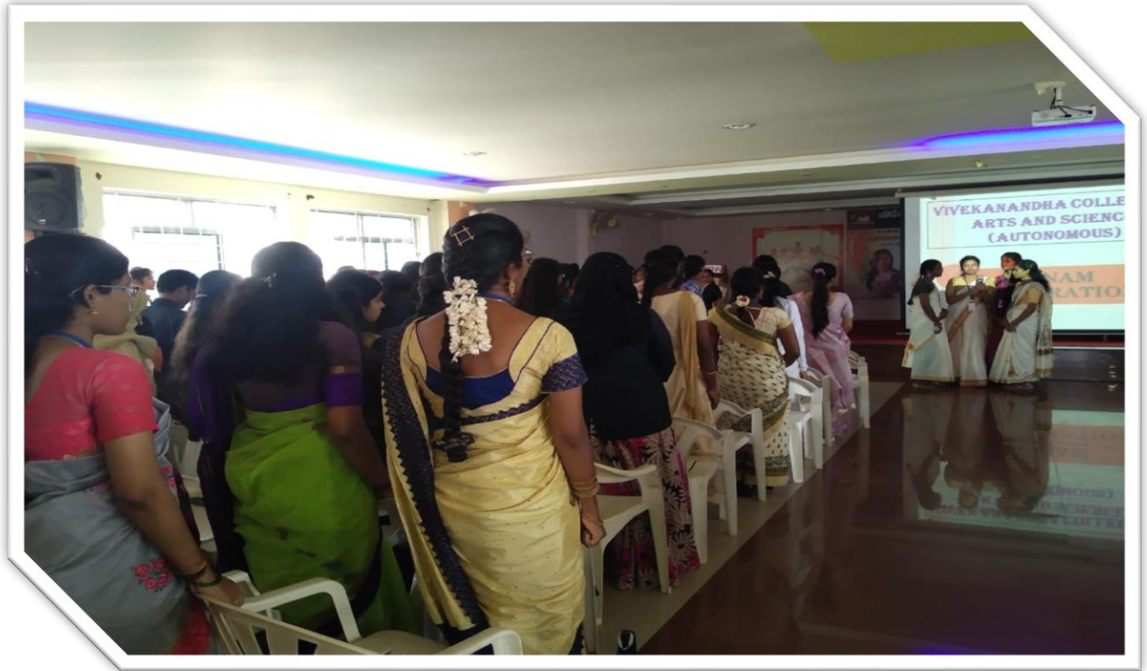
Students sang the Prayer song at Multipurpose Hall, VICAS