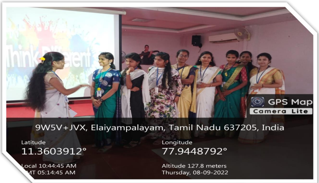
Students showed their Special talent at Multipurpose Hall, VICAS