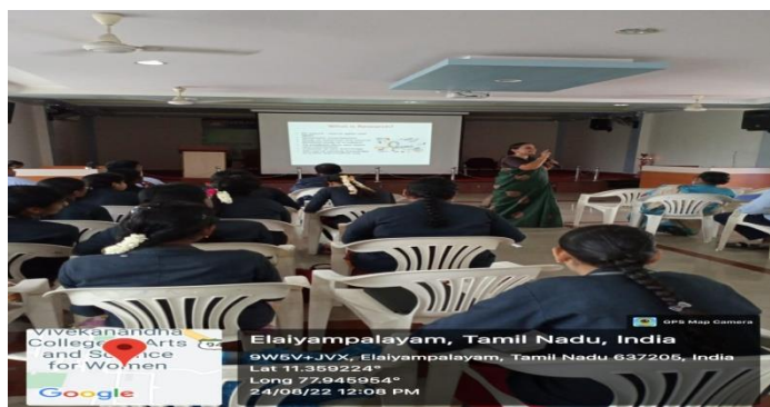
DAY – I INTRODUCTION OF RESEARCH AND RESEARCH METHODOLOGY