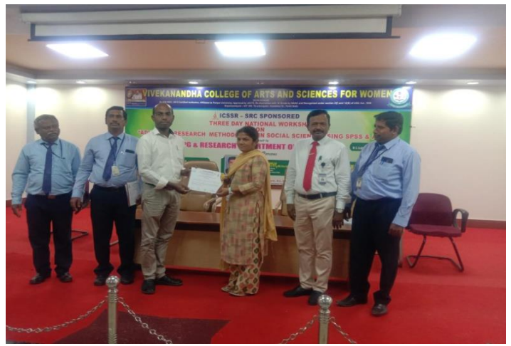
CERTIFICATE DISTRIBUTION BY DAY – III RESOURCE PERSON