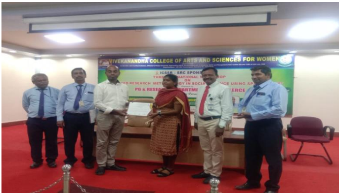
CERTIFICATE DISTRIBUTION BY DAY – III RESOURCE PERSON