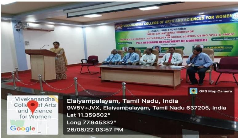
PARTICIPANTS FEEDBACK SESSION ON THIRD DAY OF WORKSHOP