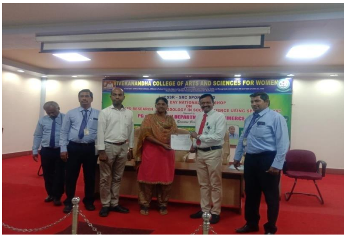
CERTIFICATE DISTRIBUTION BY DAY – III RESOURCE PERSON