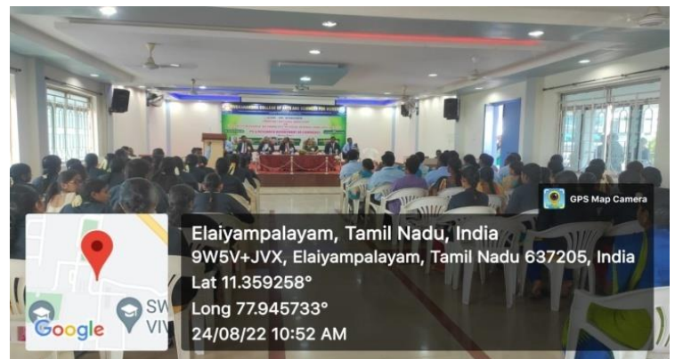
FIRST DAY – INAGURATION FUNCTION ON 24.08.2022