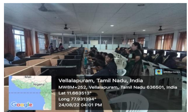
DAY – I PRACTICAL LECTURING IN THE WORKSHOP