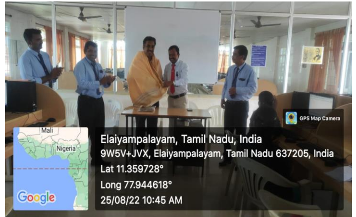
DAY – II GUEST OF HONOUR BY DIRECTOR OF COMMERCE AND MANAGEMENT STUDIES