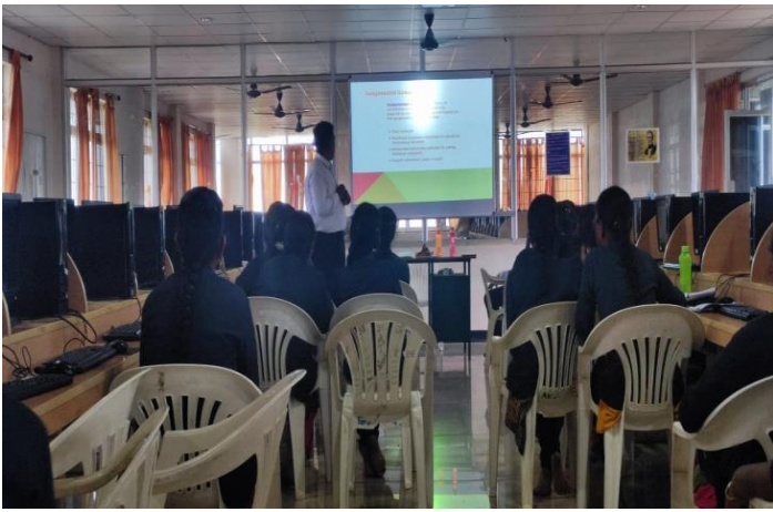
DAY – II PARTICIPANTS ATTENDING THE PRACTICAL LECTURE