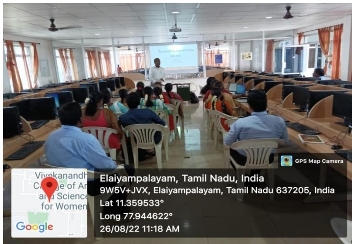
DAY – III – RESOURCE PERSON EXPLAINING THE CONCEPT OF RESEARCH AND RESEARCH METHODOLOGY