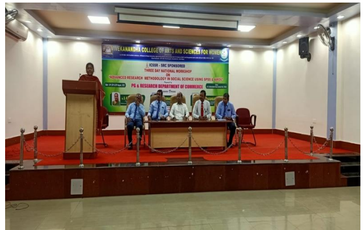
PARTICIPANTS FEEDBACK SESSION ON THIRD DAY OF WORKSHOP