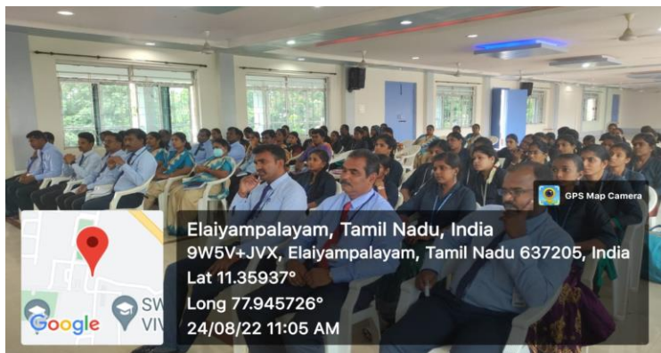
FIRST DAY – INAGURATION PARTICIPANTS ON 24.08.2022