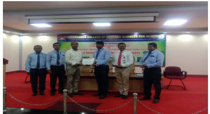
CERTIFICATE DISTRIBUTION BY DAY – III RESOURCE PERSON