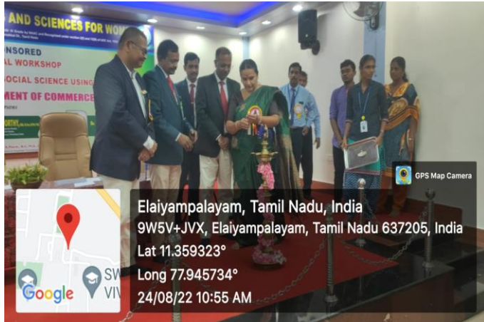
FIRST DAY – INAGURATION FUNCTION ON 24.08.2022 LIGHTENING THE LAMP BY CHIEF GUEST