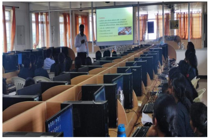
DAY – II RESOURCE PERSON ENLIGHTENING THE FACTOR ANALYSIS